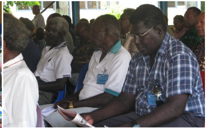
Members of the Western delegation during the proposed State Boundaries and Special Areas Meeting in April at St. Nicholas Hall.