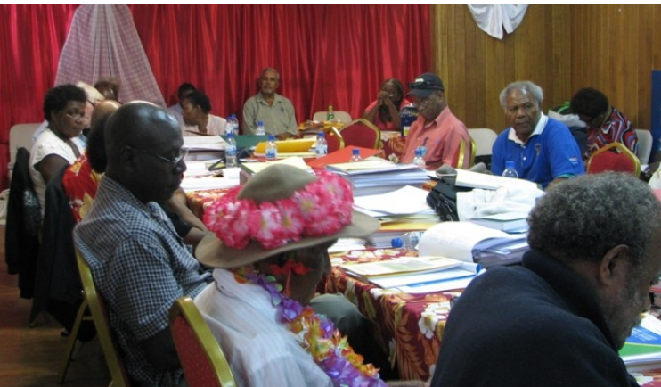
Members of the second Joint Plenary during the review of the 2009 Draft from the 2009 Feedback.