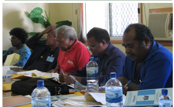
Team leaders' meeting at Pacific Casino conference room in July.